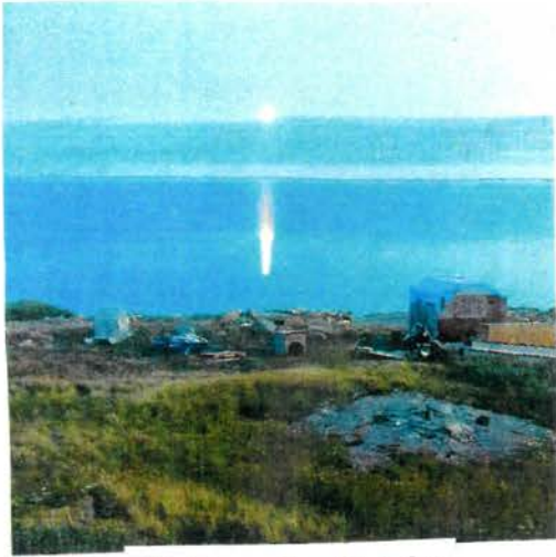
Fishing at midnight