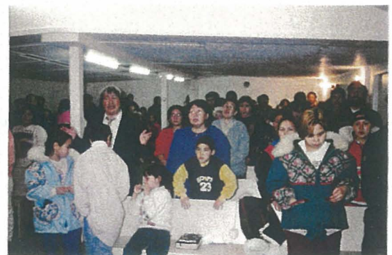
REPULSE BAY CHRISTIANS