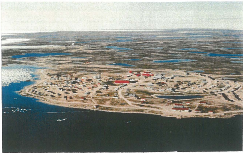
CAMBRIDGE BAY, NU