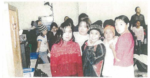
HAPPY INUIT CHILDREN