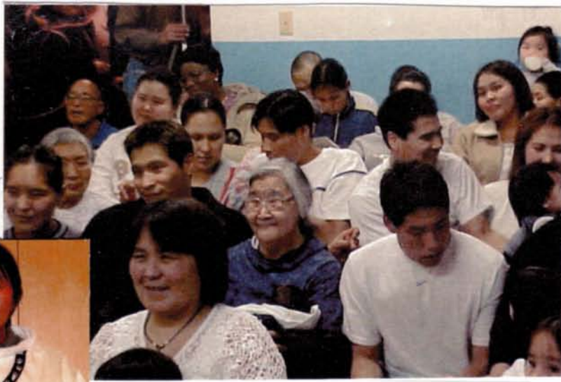
CAMBRIDGE BAY CHURCH SERVICE