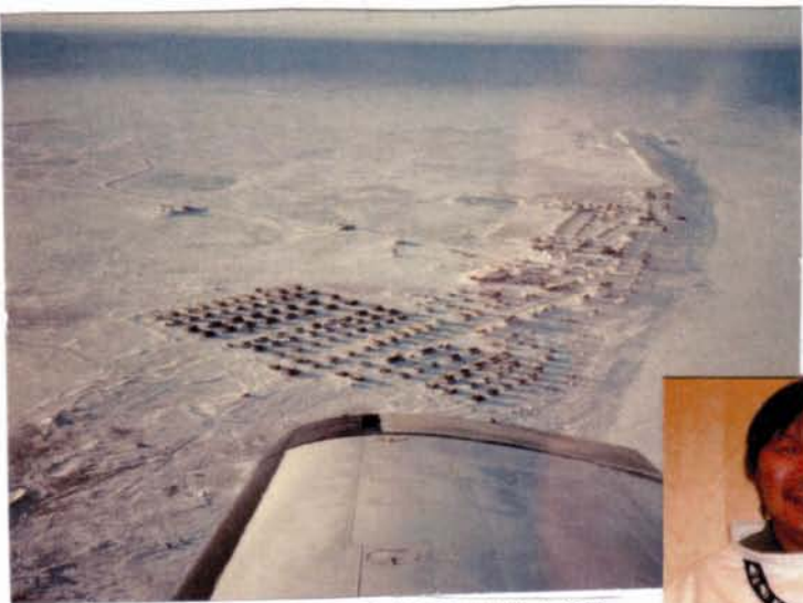
CAMBRIDGE BAY VILLAGE