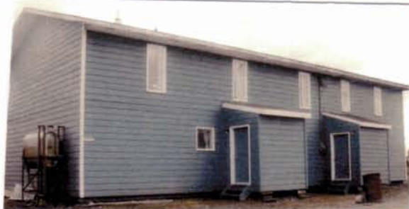
BIBLE SCHOOL RESIDENCE